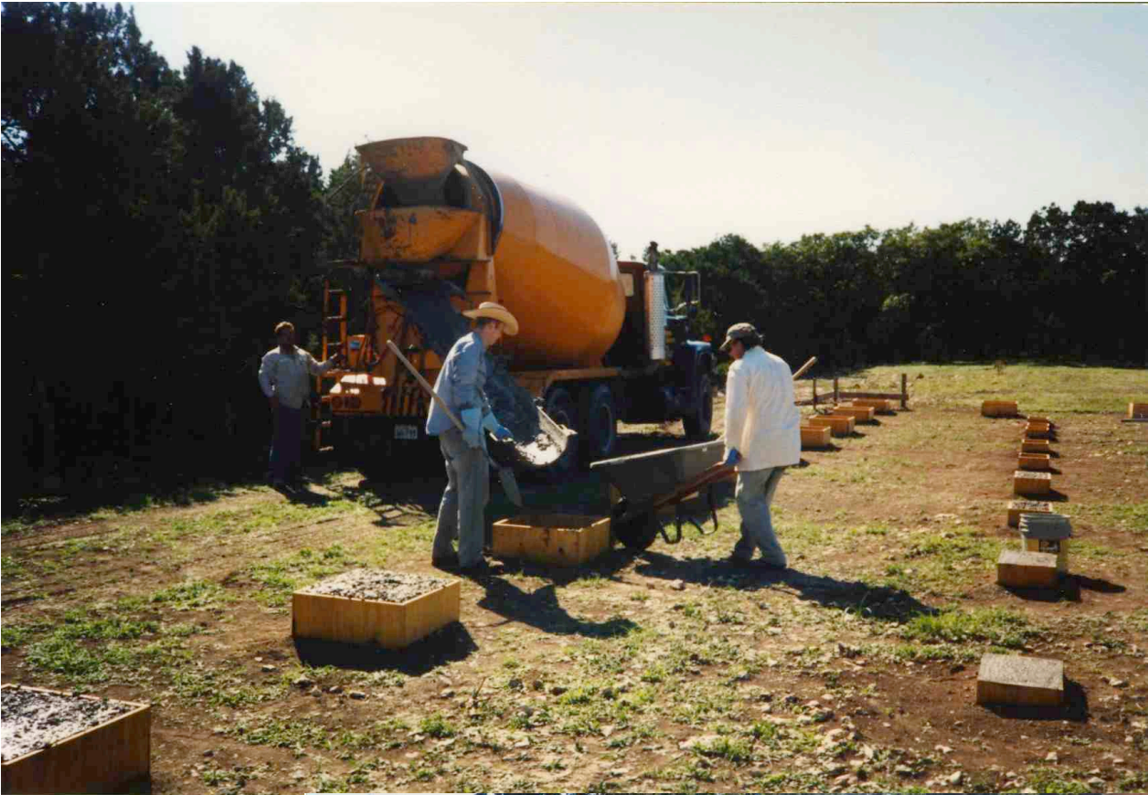
Concrete truck arrives. We pour and put in brackets.