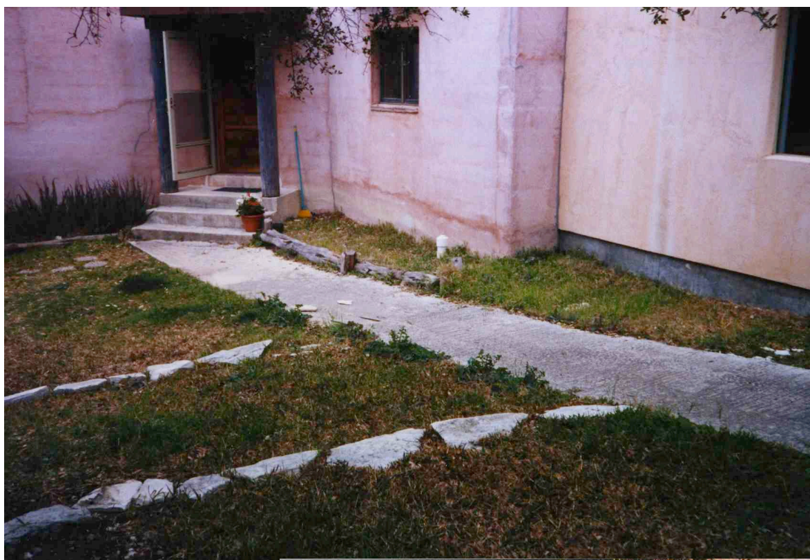
Front of house originally. Tom putting in stone walkways.