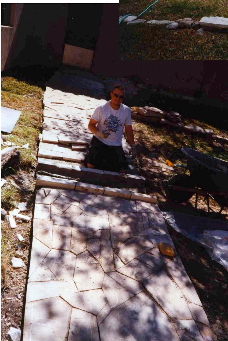
Cutting stones precisely to fit like a puzzle. Working on a drain and step.