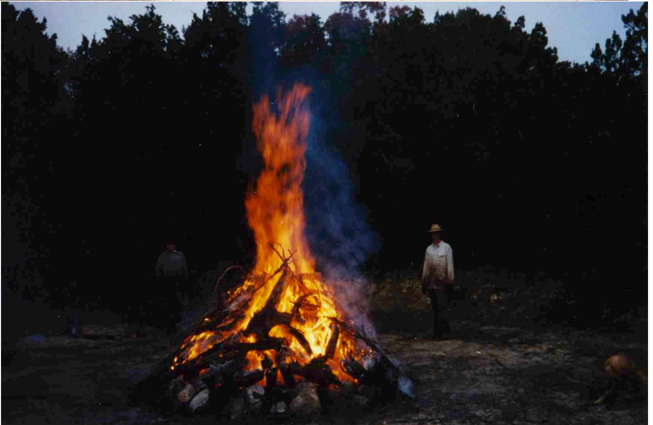
Building almost done.

Fire: we burned whole forests worth of trees and branches cleared around the ranch. At times we were actually throwing wood up above the head to get onto the pile.