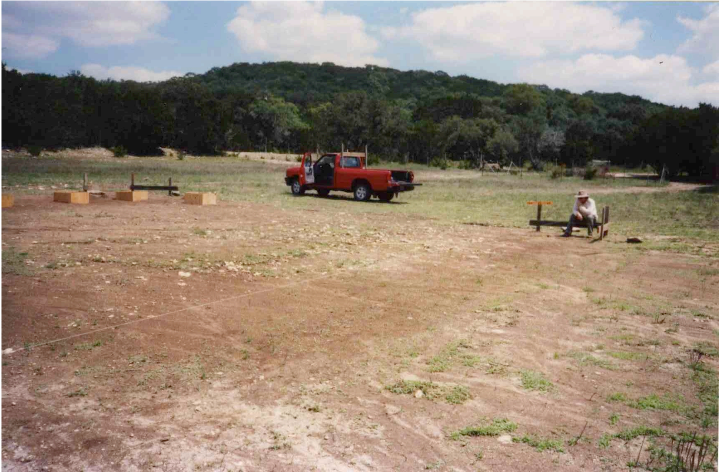
Stringing layout for foundation.