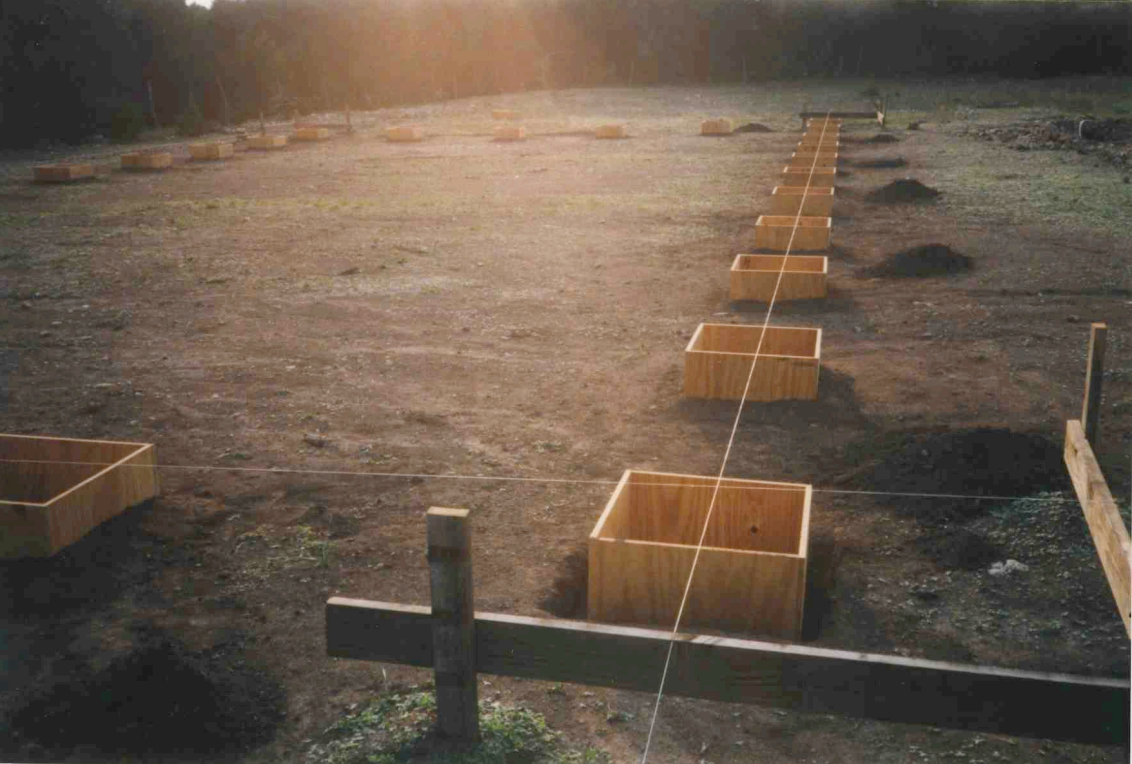
Laying framing for concrete in exact locations with the center in line and precisely 8 feet a part. With fixed steel brackets to hold 4X6 beams to be sunk into the wet concrete, having to be in a precise line and precisely 8 foot on center. And all has to be put in before the concrete dries!