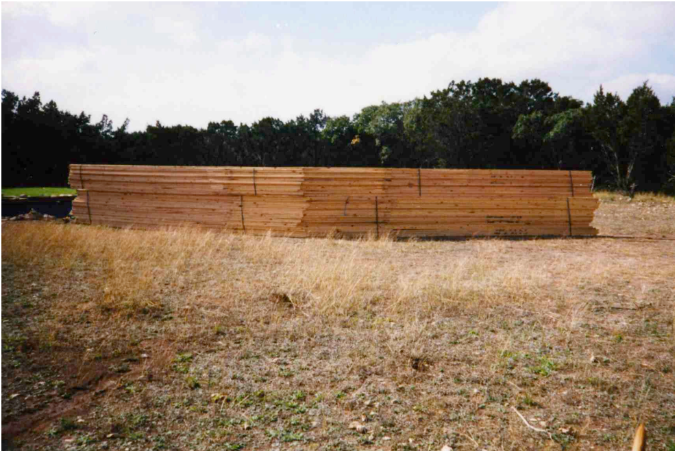
Semi truck brings the factory manufactured trusses to span 44 feet so we wouldn't need pillars in the dojo space.