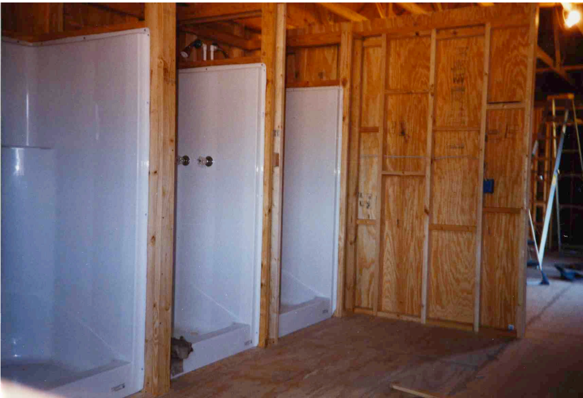
Shower stalls going in.

This was all done in the winter, no heat, and it was freezing!