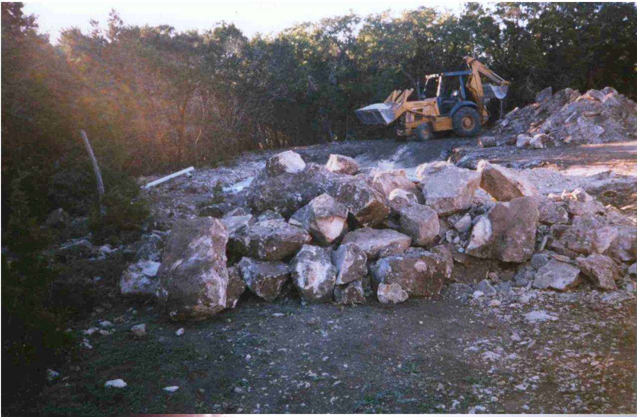
Septic hole is dug, look at the rocks we pulled out of the ground! No kidding. We formed a wall around that side of the field to back fill soil for the leach lines.