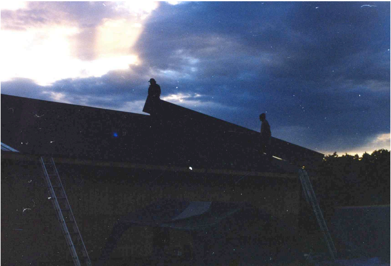
Metal siding goes up.