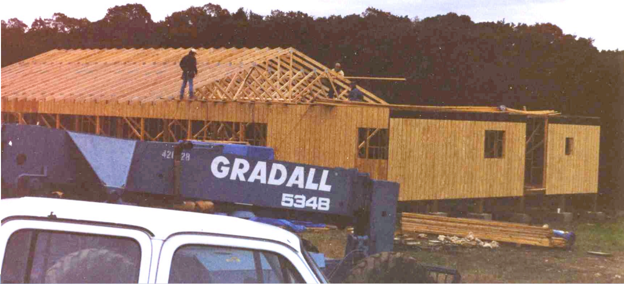
Trusses go up. Must take care since each one weighs 225 pounds!