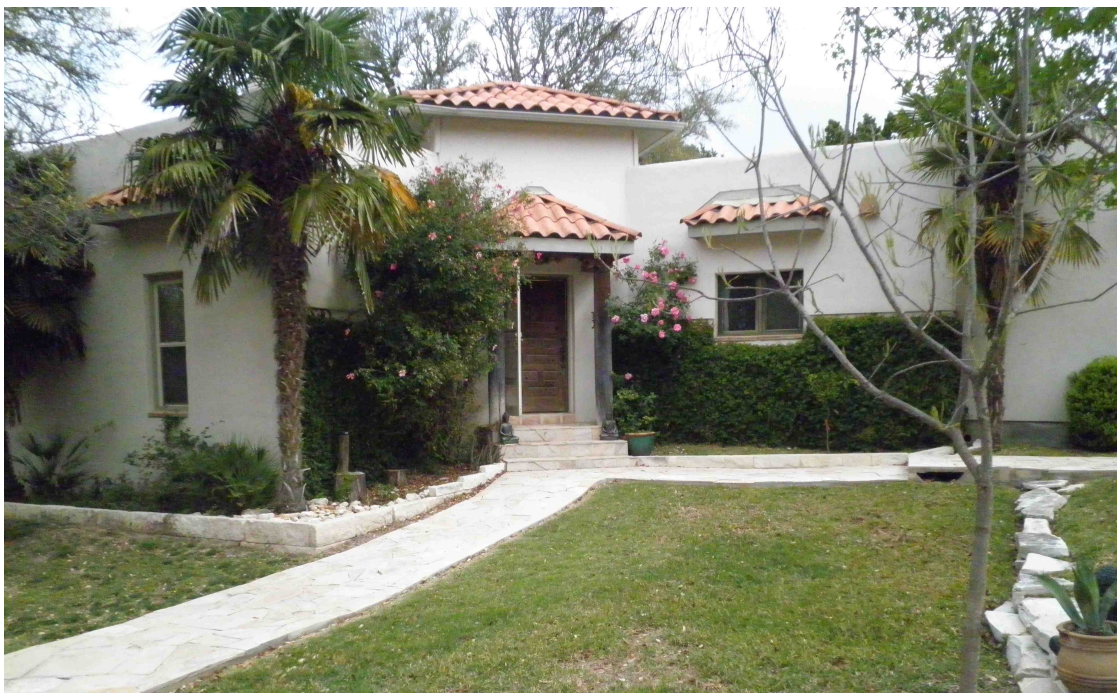
Front of the house today, painted with walkways done (2013).