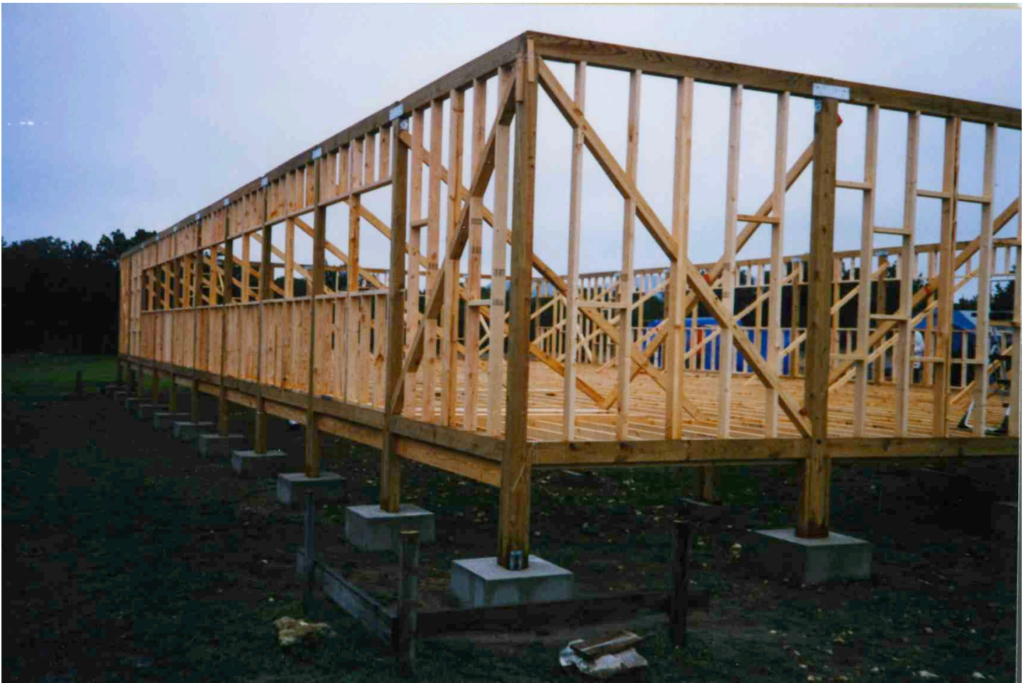
Frame goes up, gets filled in and braced up.