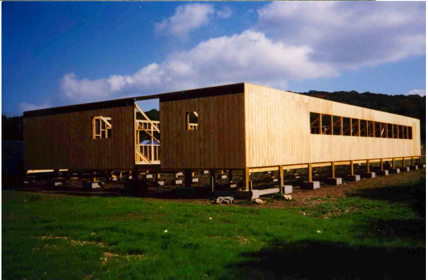
Tar paper goes up over frame; then siding cut in.