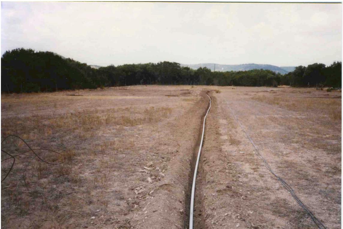
Water line laid. Electric waiting on the right side, That much thick electric cable is very heavy. Had to use truck to pull it up the hill.