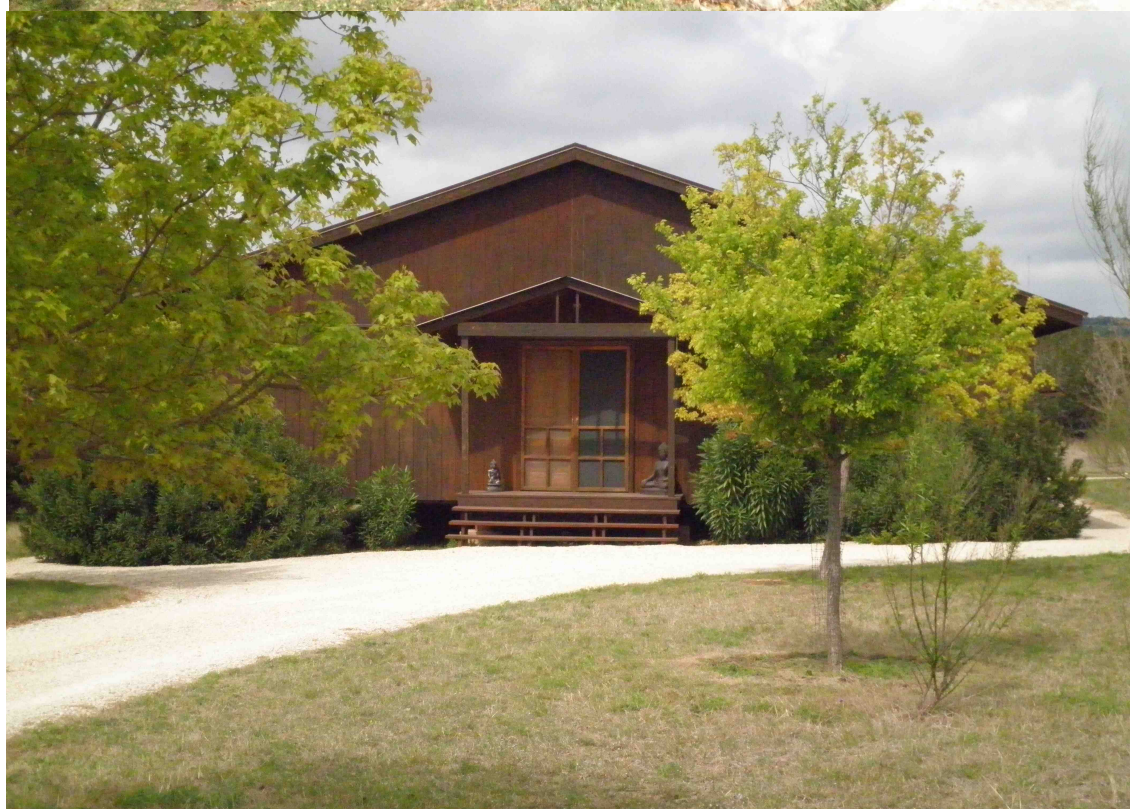
Dojo today, with trees.