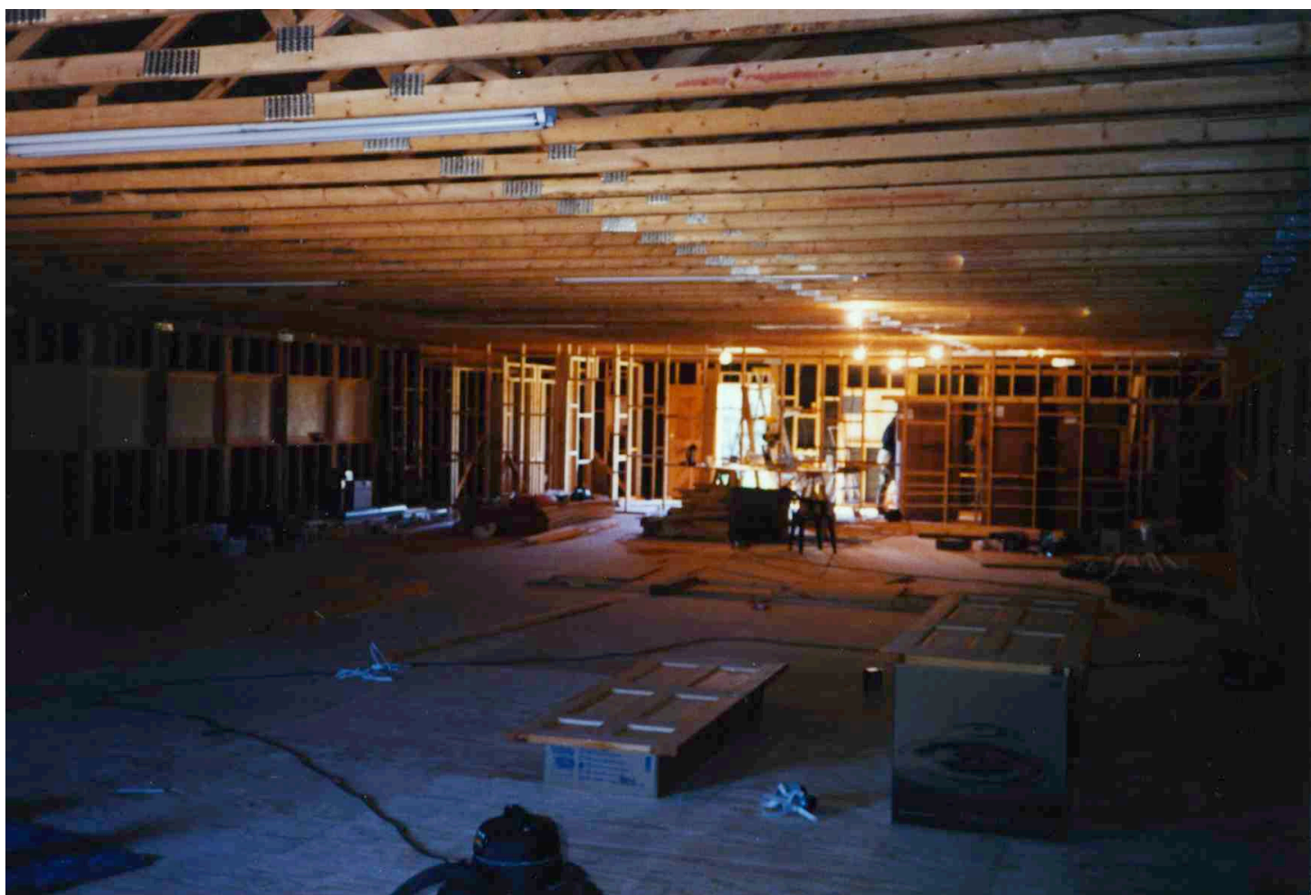
Put in the floor panels, framing up the back wall for showers, toilets, and sinks. Doors waiting to go up.